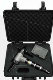
Optional Plastic Box