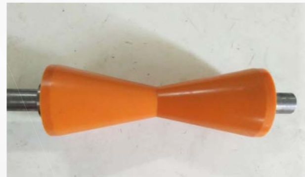
Steel Roller with PU